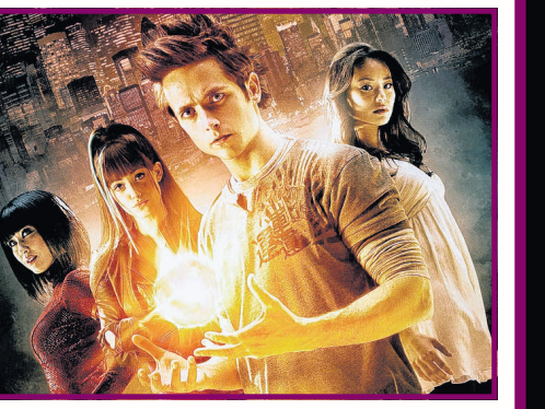
■ The stars of Dragonball: Evolution